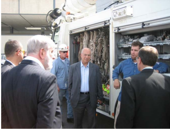
Jordanian distribution executives examine SMUD bucket truck.