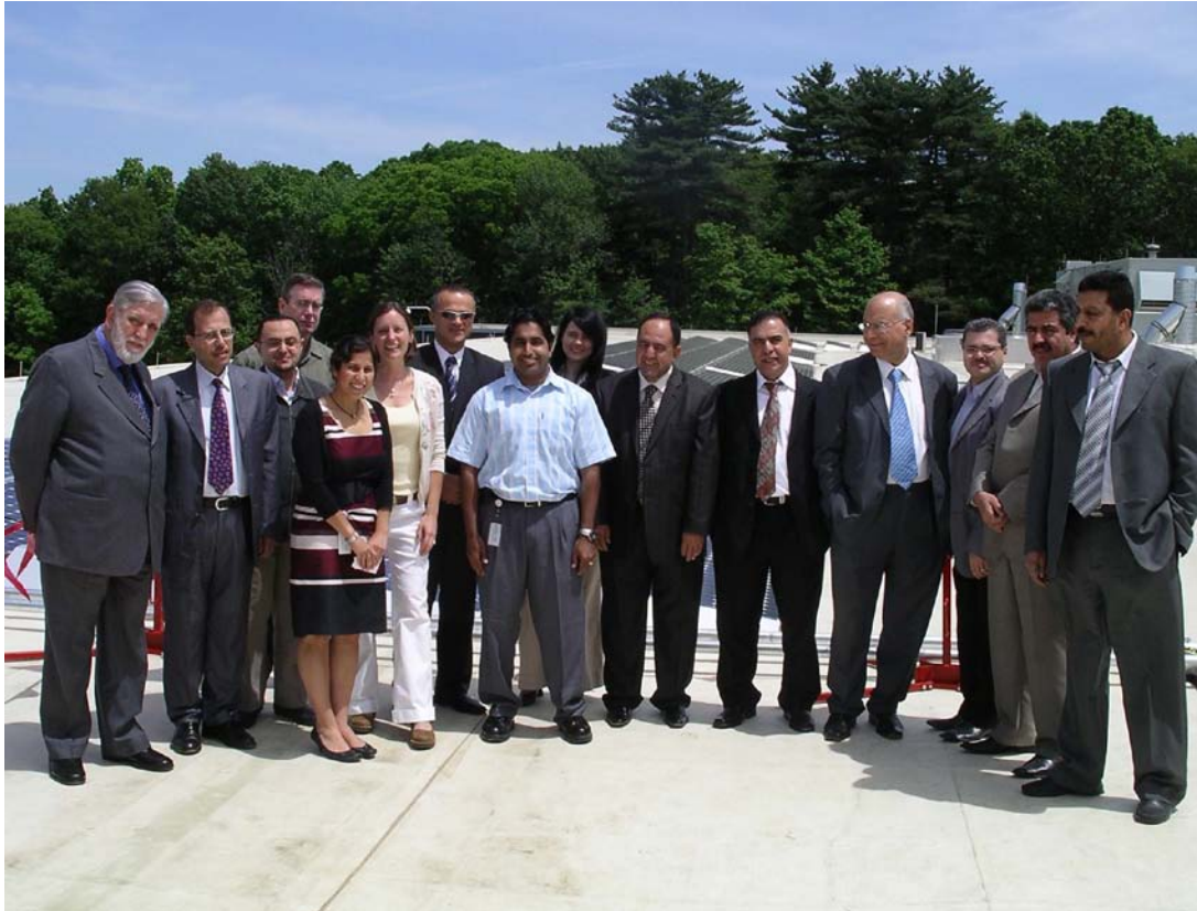
Delegation inspects solar photovoltaic rooftop of National Grid's new headquarters, a Gold LEED building.