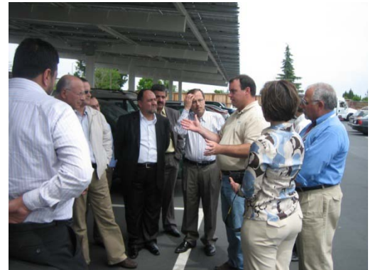
Delegation inspects Siemens' manufacturing plant in Sacramento, California with solar PV on roof and parking structures that provide 50% of the facility's energy needs.

USEA is currently planning a follow up visit to Amman, Jordan in September 2009.