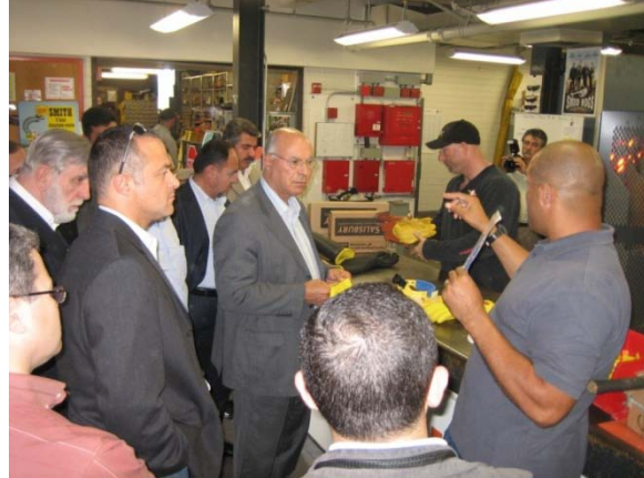
Delegation in SMUD's field equipment testing facility. This facility tests gloves, hot sticks, rubber sleeves and all other equipment used when working on energized power lines. Utilities in Jordan do not have similar testing of equipment.

SMUD also discussed at length its approach to distribution system planning and loss reduction which was of great interest to the delegation. The Jordanian delegation noted a large difference between their transformer loading and number of transformers on the system and SMUD's. SMUD has nearly 80,000 transformers – about 1 per 8 customers. SMUD's total losses are 7% with distribution losses comprising 60% of the total losses. In contrast to Jordan's system, SMUD's lines are short and distribution substations are fairly close so losses are lower.